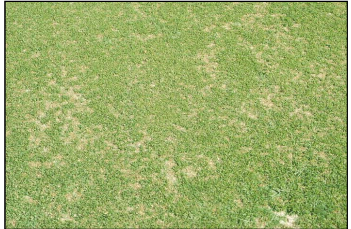
Figure 1. Infected plants die in dime-sized spots, and often leave pits or depressions in the surface of putting greens.

Initial symptoms therefore appear as wilt and individual infected annual bluegrass plants quickly turn reddish-brown or yellow, and die in whitish-tan spots about the size of a dime (Figure 1).