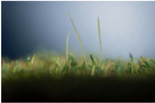
Figure 2. Elongated leaves in unmown areas may be an indicator of bacterial wilt.

Another symptom of bacterial wilt sometimes can be seen in annual bluegrass located along the perimeter of infected putting greens. These areas generally are mown less frequently (i.e., clean-up cut) and individual leaves of infected plants may become unusually elongated (Figure 2).