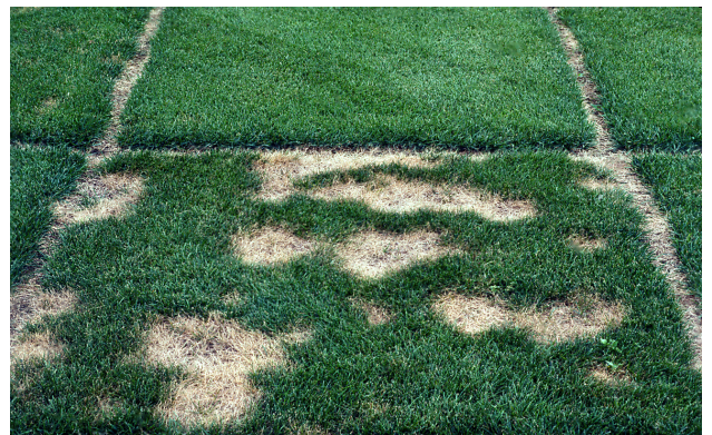
Summer Patch of Kentucky Bluegrass