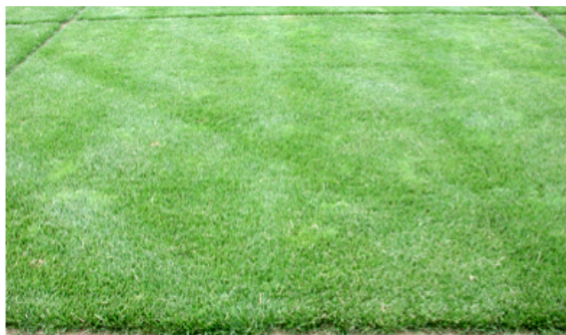
turf-type tall fescue